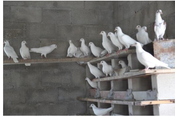
The Pigeon barn in Beit Qad

In Beit Qad village (located 5km from the city of Jenin), we provided a farmer with the materials needed to start his pigeon barn. “Caritas Jerusalem has provided me with everything I needed. Thanks to them I was able to improve my barn and have plans to expand it” said the barn owner.