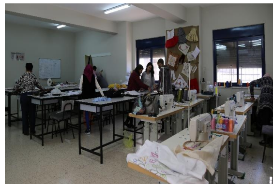
Women training in the center