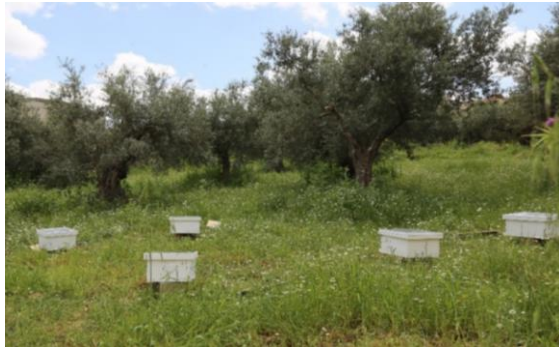
Newly delivered beehives in Jenin area

Jenin, the northernmost city in the West Bank is enjoying an economic boom in recent years due to its strategic location, but the rural areas in Jenin are still under-developed. Many small landowners lack the financial resources to develop their land or to start microbusinesses to meet the rising demand of local markets.