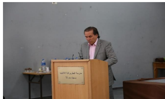
Ambassador of Chile to Palestine