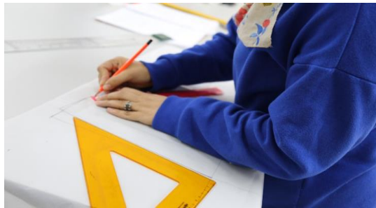
Iqbal drawing a dress she designed

Caritas Training Center (CTC), established in 2014, provides training in dress design, sewing, types of fabrics, tailoring and embroidery. It aims to promote women's employment and decrease the participation gap of men and women in the labor force. So far more than 90 women from 21 villages and towns around Ramallah have benefitted from the training and 20 women were able to start their own micro businesses. We interviewed some of the women who will graduate in June.