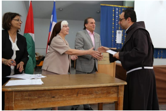
Granting the scholarship cheques to school representatives